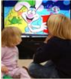
If Unsure, Refer

Contributors: Washington State Department of Health, UW – Center on Human Development & Disability, DSHS Children’s Administration